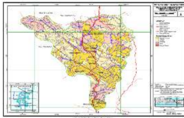
Figure 4. Map of Erosion Hazard Rate in Alo drainage basin

The table shows that four land units, D 1 IIIPt (89.599 ton/ha/year), D 1 VPC (15.657 ton/ha/year), S 1 IVB (67.652 ton/ha/year), and S 1 IVPt (102.608 ton/ha/year) are in the critical zone. These units are scoring high to extremely high EHR value. This results from the slope steepness and CP value as the key factors. In particular, land unit D 1 IVPt is in class IV steepness. However, its use as dry farmland makes it under bad caretaking and accordingly has a CP value of 0.007. Besides, soil solum of the unit is shallow, only 35 cm, by that, the actual erosion exceeds the tolerable erosion rate. Further, figure 6 displays the spread map of EHR in the Alo drainage basin.