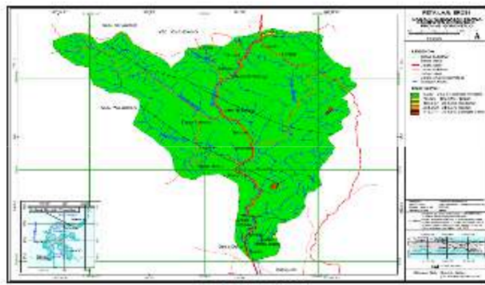
Figure 3. Map of soil surface erosion (A) of Alo watershed

Table 4 elucidates that there are three groups of erosion rate; group I with A value more than 100 tons/hectare/year, group II having A value of 10-100 tons/hectare/year, and group III with less than 100 tons/hectare/year of value. Land unit S 1 IVPt (5.40 hectares) is included in the first panel, with A value of 102,608 tons/hectare/year, making it the largest A value of all units. It is due to the factors of slope length and steepness. It has average soil loss of 0.06 mm/year, being smaller compared to average soil loss of entire Alo watershed, losing 3.10 mm soil annually.