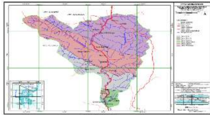
Figure 1. Map of Alo drainage basin